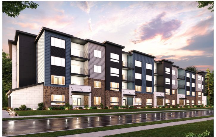
BUILDING 2 ELEVATION