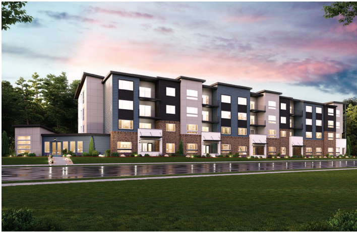
BUILDING 1 ELEVATION

APPROX. 1,267 SQ. FT. | 1-STORY | 2 BEDROOMS | 2 BATHROOMS